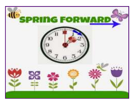
Sunday, March 10th

will be cancelled. If church service is cancelled on Sunday we will post the announcement on KETV and WOWT.