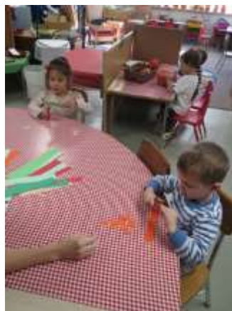
Cutting practice making "snips"