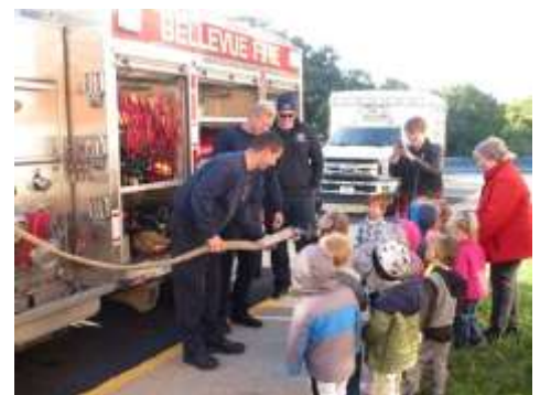
A visit from the firefighters