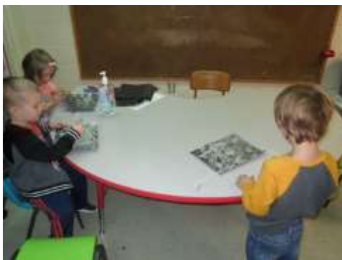
Lacing spider webs