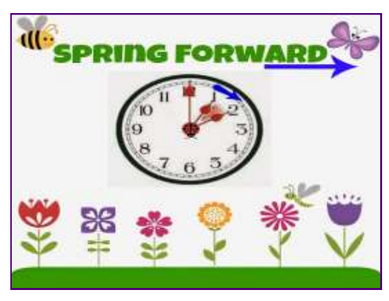
Sunday, March 8th

Instead of giving up something for Lent this year, why not add something? Join us for a time of fellowship and reflection as we embark on this period of repentance and preparation for Christ's passion.